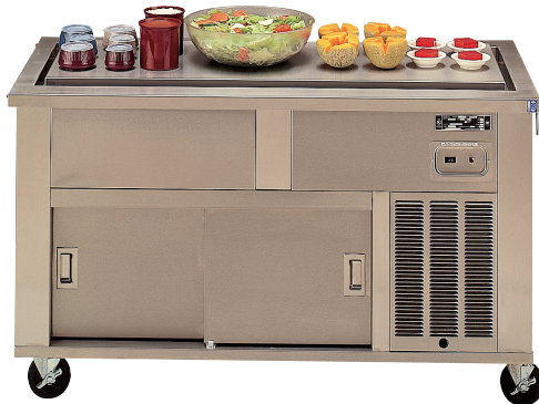
3-FT shown with sliding doors

The Elite 500 Frost Top Units are perfect for dessert or salad merchandising such as parfaits, pastry, jello and a variety of salads. Elite 500 units are compatible and will interlock with other Elite units. This allows the units to be disconnected for cleaning under the serving line. The modular design of Elite 500 allows you to design either a cafeteria or buffet line-up and choose only the options and accessories that you want and need.